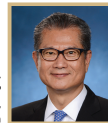
Mr Paul CHAN Mo-po, GBM, GBS, MH, JP Financial Secretary, The Hong Kong Special Administrative Region