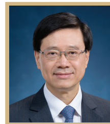
Mr John LEE Ka-chiu, SBS, PDSM, PMSM, JP Secretary for Security The Hong Kong Special Administrative Region

On the occasion of the establishment of the Midwives and Maternal-Child Caregivers Association, I would like to offer my warmest congratulations and wish the Association every success in enhancing child delivery and maternal care services, and in promoting the professionalism of practitioners.