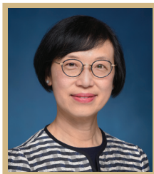
Professor Sophia CHAN Siu-chee, JP Secretary for Food and Health, The Hong Kong Special Administrative Region